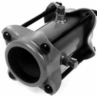
For drilled-end pipe